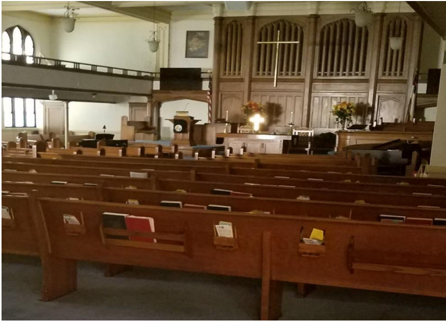
(10/23/2018) First Christian Church (DOC), 803 N. Marker Street, Mt. Carmel, IL 62863

“There’s a sweet, sweet Spirit in this place, and I know that it’s the Spirit of the Lord;